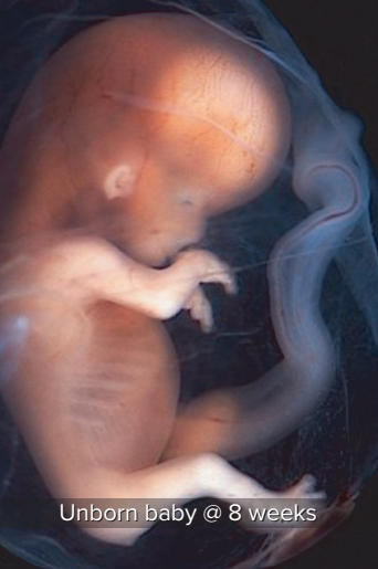
Unborn baby @ 8 weeks

Every Catholic needs to know that the current vaccines for COVID-19 (Coronavirus) have been tested on, or actually contain, cell lines that were originally derived from tissue of babies murdered by abortion .